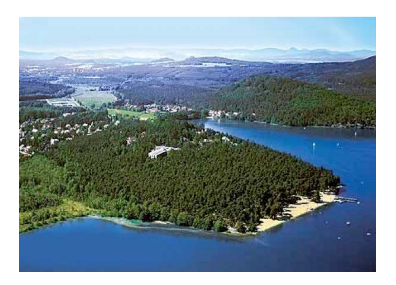
Mácha's Lake Countryside