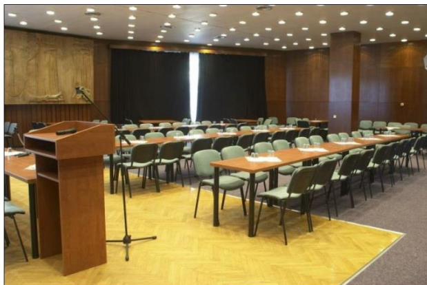
The hotel's congress hall