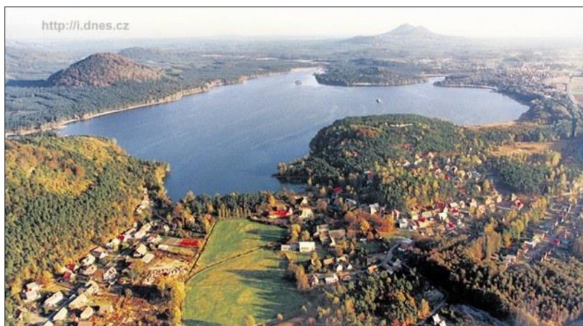
The Mácha's Lake