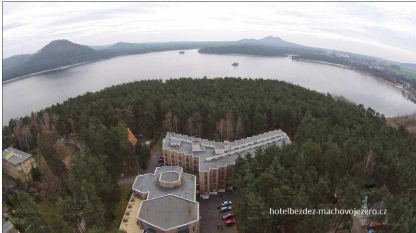
View of the Hotel Bezděz

The organizer will not assume any responsibility whatsoever for damage or injury to persons or property during the course. Participants are recommended to arrange for their personal travel and health insurance.