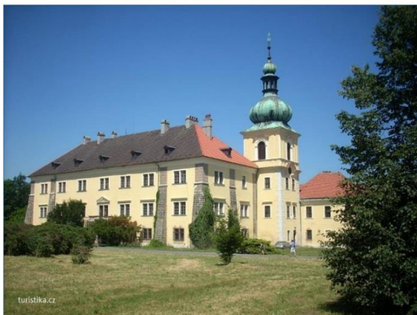
The Doksy castle

The town of Stare Splavy, situated on the northern shore of the lake, became part of Doksy in 1850 and has ever since contribute to the development of tourism in the region.