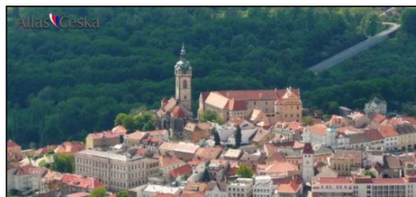
The Mělník Castle

The constant wars in the Czech lands meant hard times, which was also reflected in vine cultivation and in the trade of wine. A significant decline was experienced during the Thirty Years' War in the 17th century.