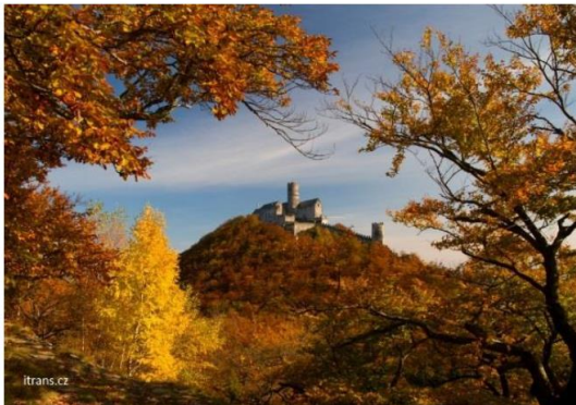
The Bezděz Castle

The dominant feature of the region is one of the most important early gothic castles in Bohemia - Bezděz . This royal castle was built on a hilltop (638 m a.s.l.) between 1260-1279 by a Czech king Přemysl Otakar II. The king Václav II. with his mother Kunhuta were held here as prisoners. During the 30years war (1618-1648) the castle was burned down by Swedish soldiers. Later it has been turned into a Benedictine monastery. After the Benedictines have left around the year 1785, the castle became deserted. It became a romantic ruin, which is described in many works by the most important Czech romantic poet – Karel Hynek Mácha.