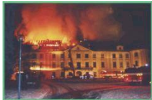
Big fire in January 2003