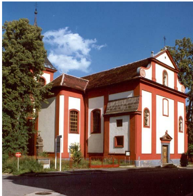
St. Bartholomew's Church, Doksy